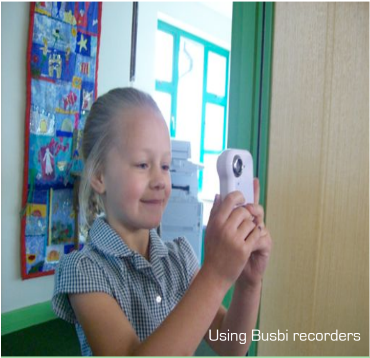
Using Busbi recorders